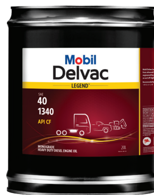
Mobil Delvac Legend™ 1340

For full details on Mobil's advanced range of heavy duty diesel engine oils visit https://ampol.com.au/fuels-and-oils/lubricants/