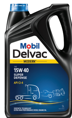
Mobil Delvac Modern™ 15W-40 Super Defense

Our range of Mobil Delvac Legend™ high-performance monograde diesel engine oils provide essential protection for older or conventional equipment.