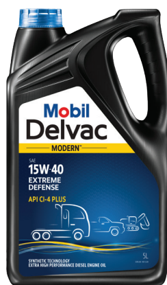
Mobil Delvac Modern™ 15W-40 Extreme Defense