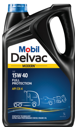
Mobil Delvac Modern™ 15W-40 Full Protection

Our range of Mobil Delvac Modern™ high-performance diesel engine oils provide advanced protection for today's modern equipment.