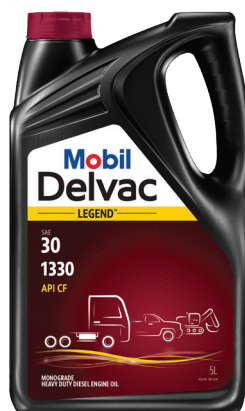
Mobil Delvac Legend™ 1330

Our range of Mobil Delvac Legend™ high-performance monograde diesel engine oils provide essential protection for older or conventional equipment.